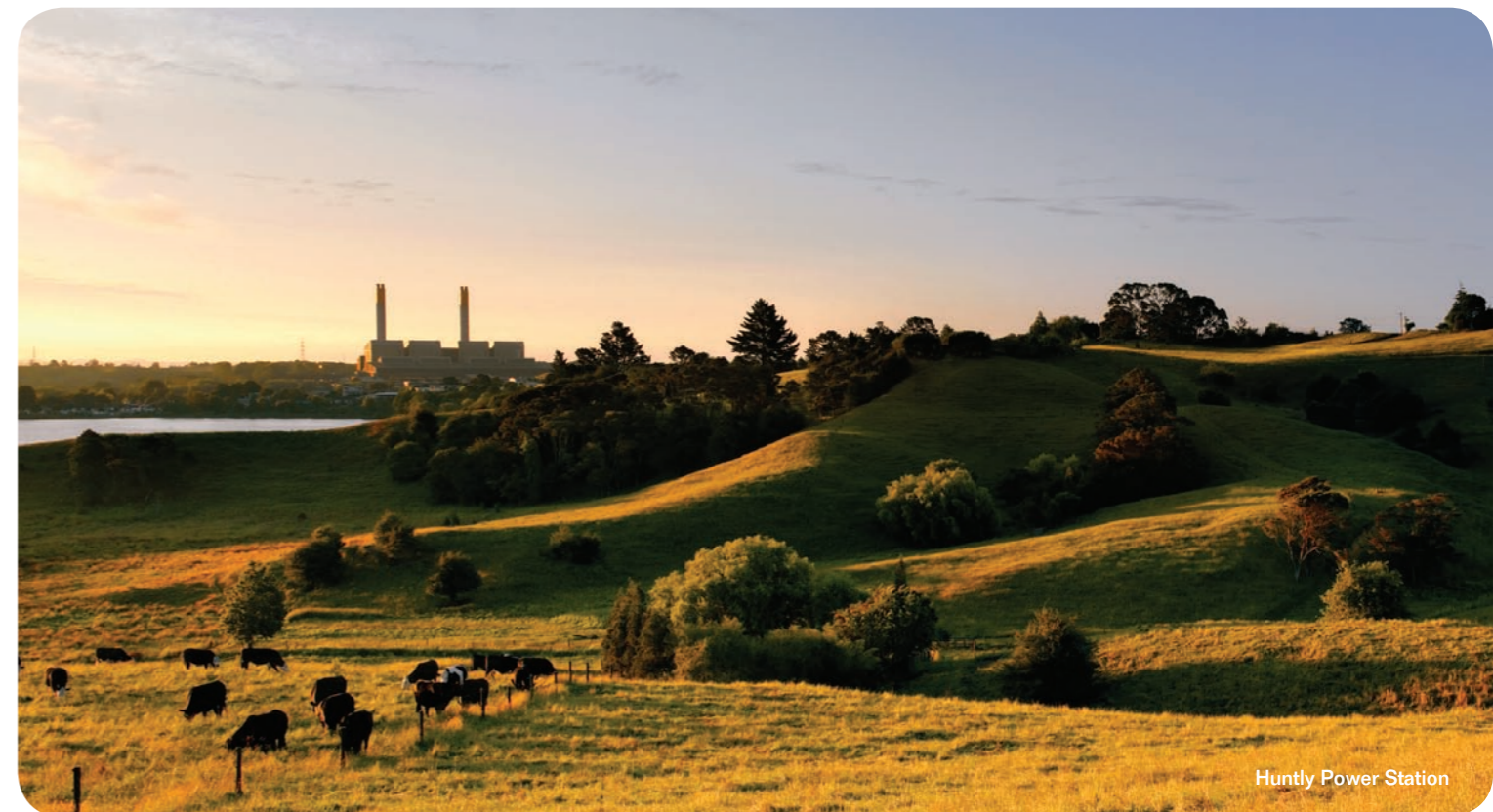
Huntly Power Station

Hydro generation uses the pressure and flow of the water to turn the turbine runner, which turns a generator that produces electrical power. A transformer boosts the voltage for the national electricity grid.